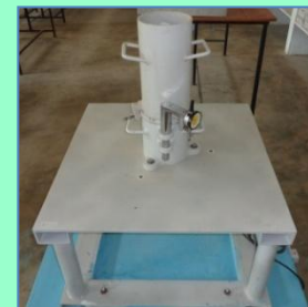
Relative density equipment