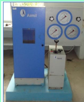
Compression Testing equipment