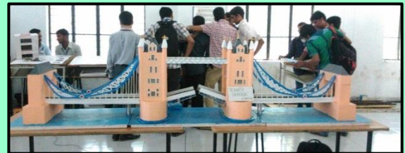
Civil Engineering Model contest and Exhibition