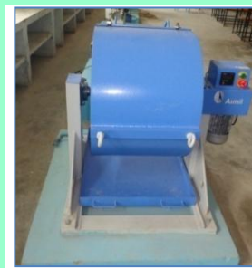
Los Angeles Abrasion testing machine