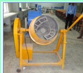
Laboratory Concrete Mixer