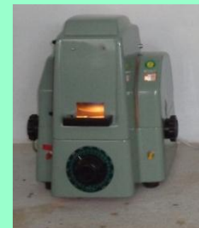
Infra-red Moisture meter